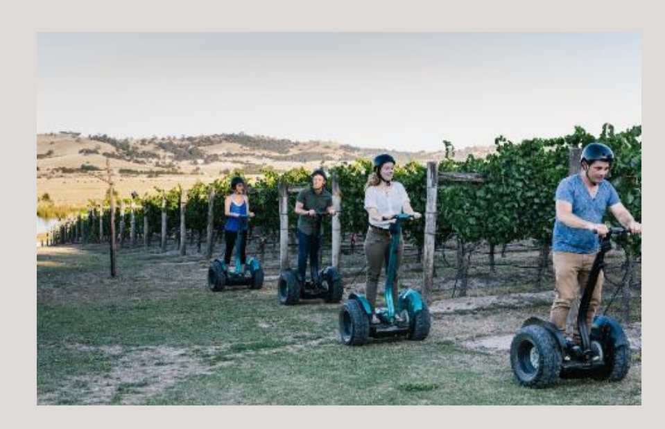
Wine Tasting, Facilitated Team Building Activities, Mindfulness and Yoga Sessions, Aqua Golf, Amazing Race and much more. Please refer to full activities brochure.