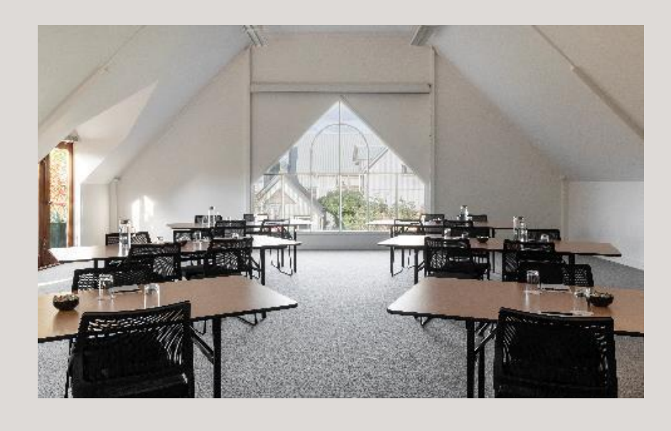
The Carriage House