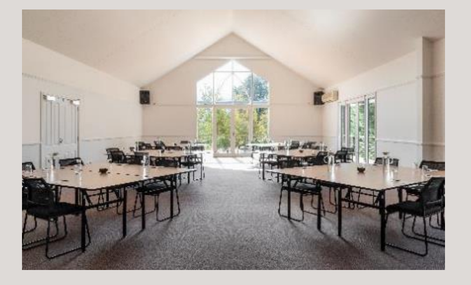
The Great Room